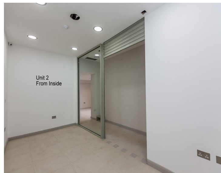
Unit 2 From Inside