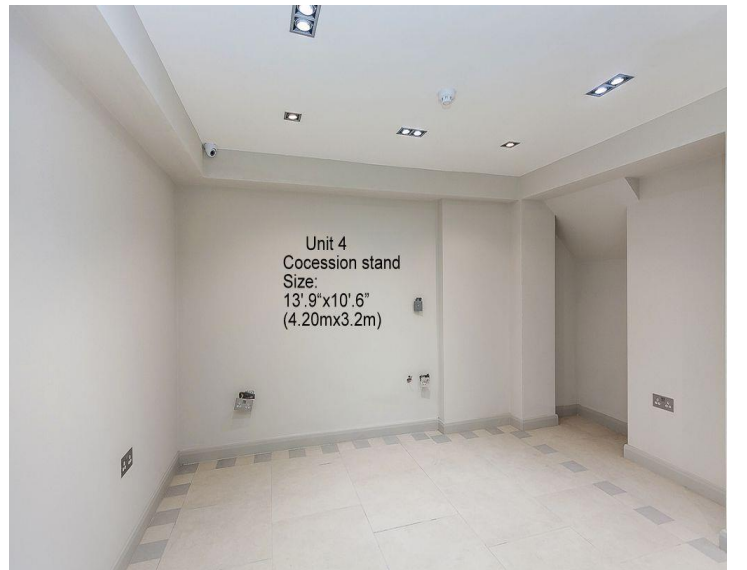
Unit 4 Cocession stand Size: 13' 9" x 10' 6" (4.20m x 3.2m)