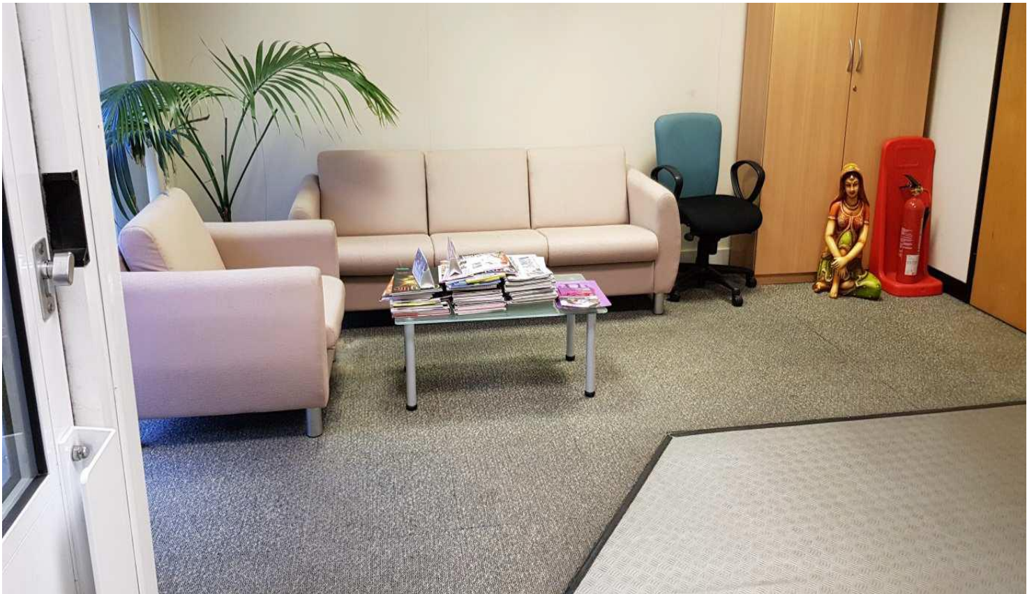
Ground floor reception area