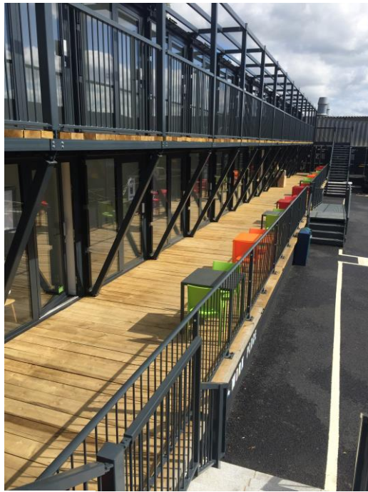
CRATE - GROUND FLOOR